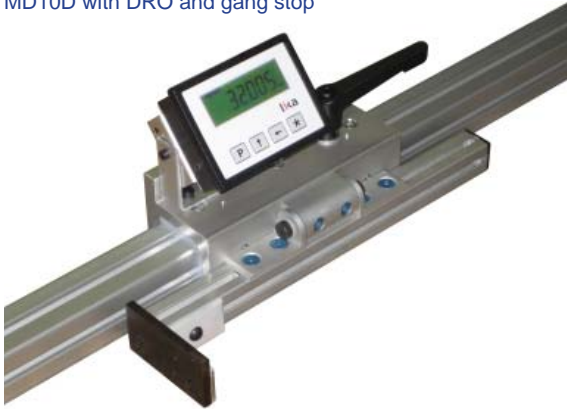
MD10D with DRO and gang stop